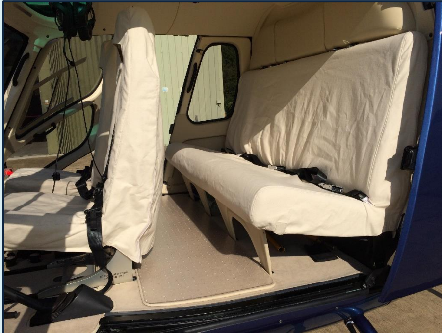
Interior showing rear seats with armrests up and cotton seat protectors on all seats