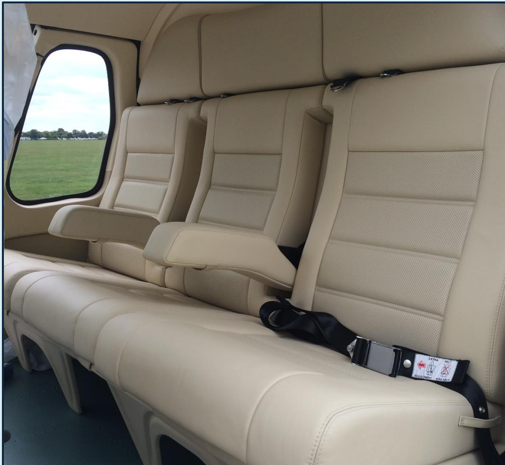
Rear seats with armrests in down position for 3 passengers. (NB Photo taken before carpet was installed)

Instrument panel – carbon fibre. Instrument panel cover in black Ultraleather with white stitching